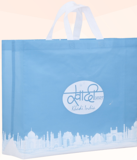
SA-058 | Khadi India

"The right bag transforms a simple purchase into a memorable experience."