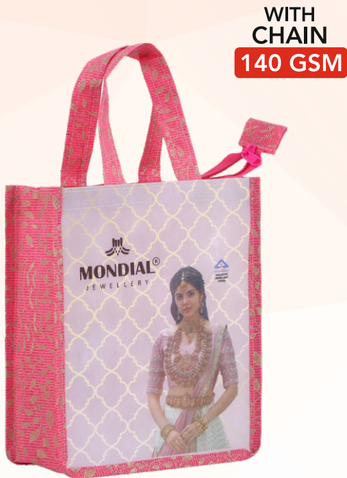
SA-071 | Mondial Small Size: 8x9.75"x3.5"

"Packaging that performs is packaging that sells."