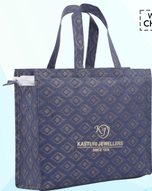
SA-067 | Kasturi Jewellers Size: 14"x11"x4"