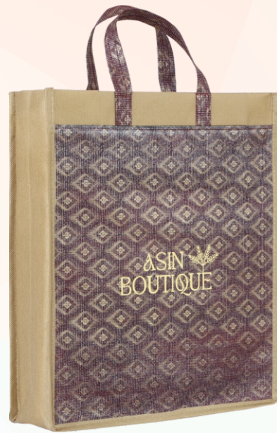
SA-010 | Asin Boutique Size: 14"x17"x5"