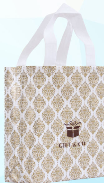
SA-061 | Gift & Co