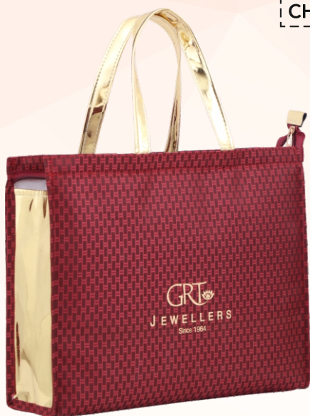
SA-064 | GRT Size: 13.5"x11"x4"