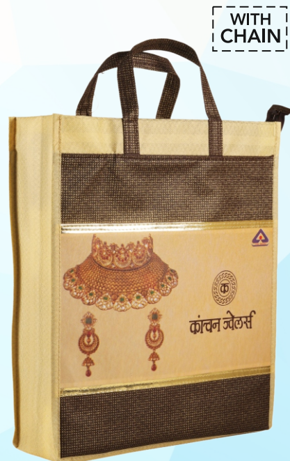
SA-008 | Kanchan Jewellers