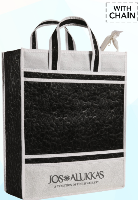
SA-007 | Jos-Alukkas