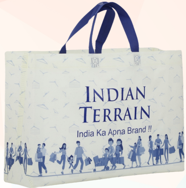
SA-055 | Indian Terrain