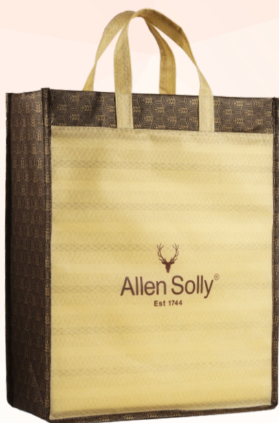
SA-001 | Allen Solly

"Your bag isn't just packaging. It's your first impression."