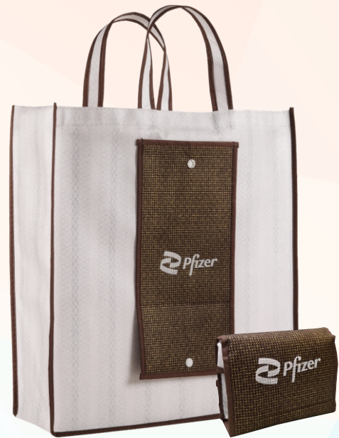
SA-025 | Pfizer Pharma Size: 15.5"x17"x5"