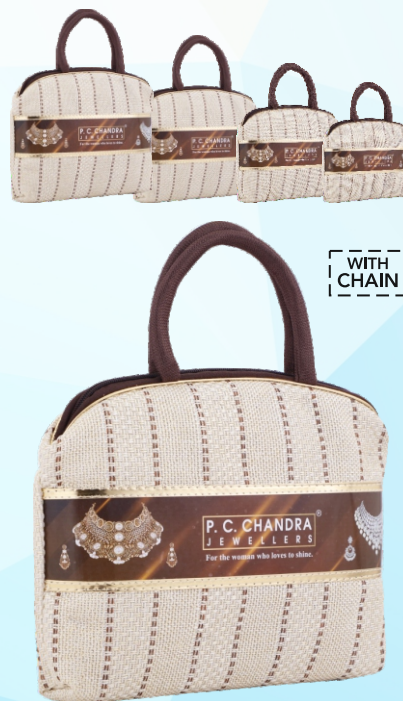
SA-068 | PC Chandra Purse