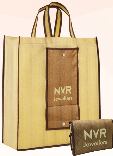
SA-024 | NVR Jewellers Size: 15.5"x17"x5"

"Your packaging is your promise. Keep it classy."