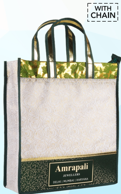
SA-092 | Amrapali Size: 12.5"x14"x5"