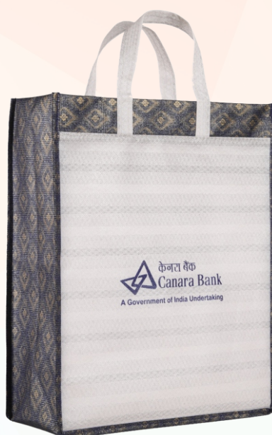
SA-002 | Canara Bank