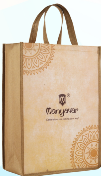
SA-003 | Manyavar