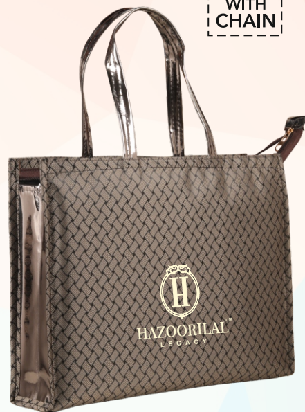
SA-066 | Hazoori Lal Size: 13.5"x11"x4"