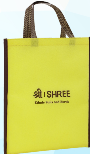
SA-012 | Shree Suits & Kurtis Size: 12.5"x14"