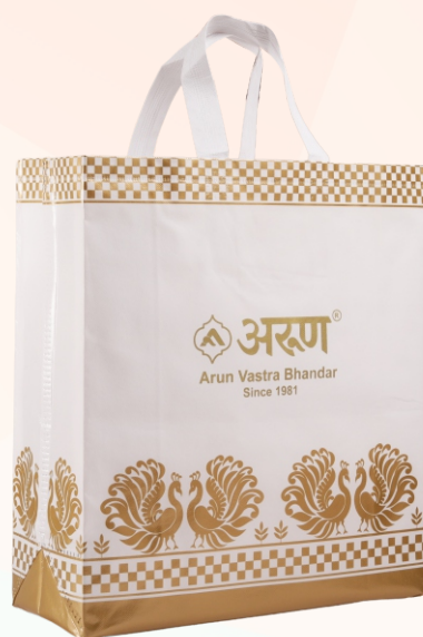
SA-050 | Arun Vastra Bhandar