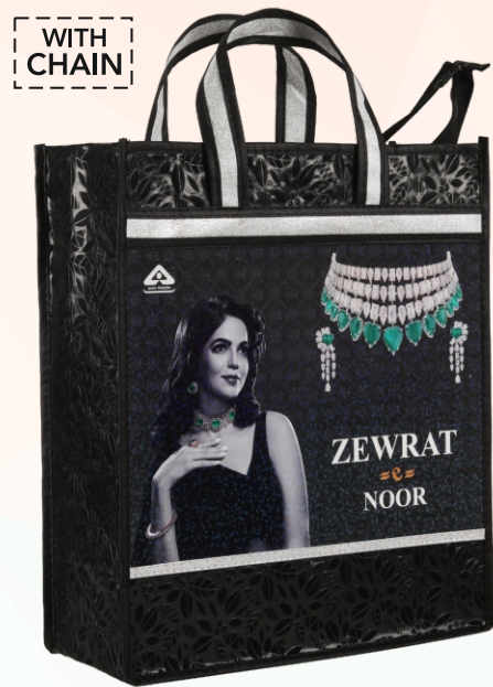
SA-022 | Zewrat-e-Noor