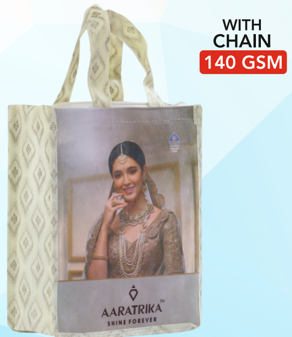
SA-073A | Aaratrika Size: 8"x9.75"x3.5"