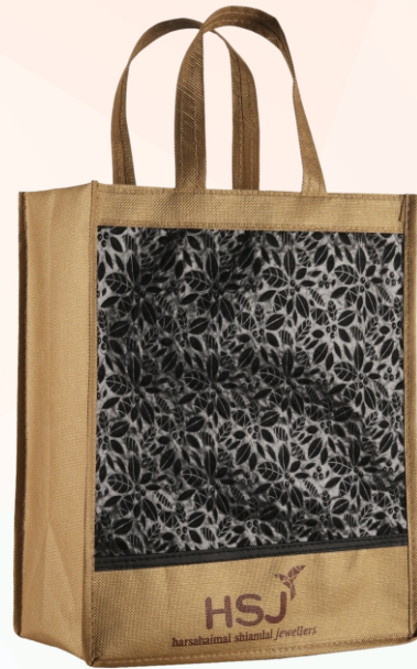
SA-006 | HSJ Jewellers