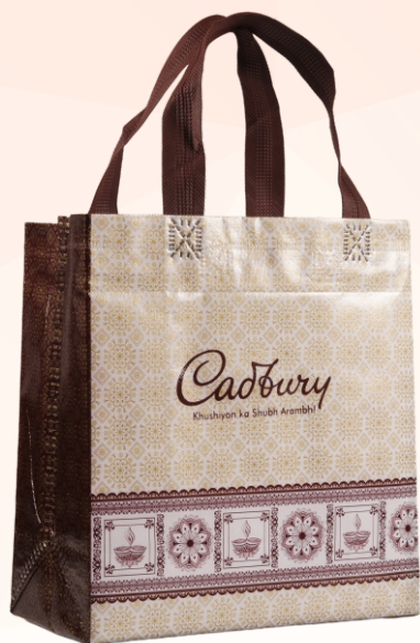
SA-049 | Cadbury

"Every customer who walks out is a moving advertisement for your business."