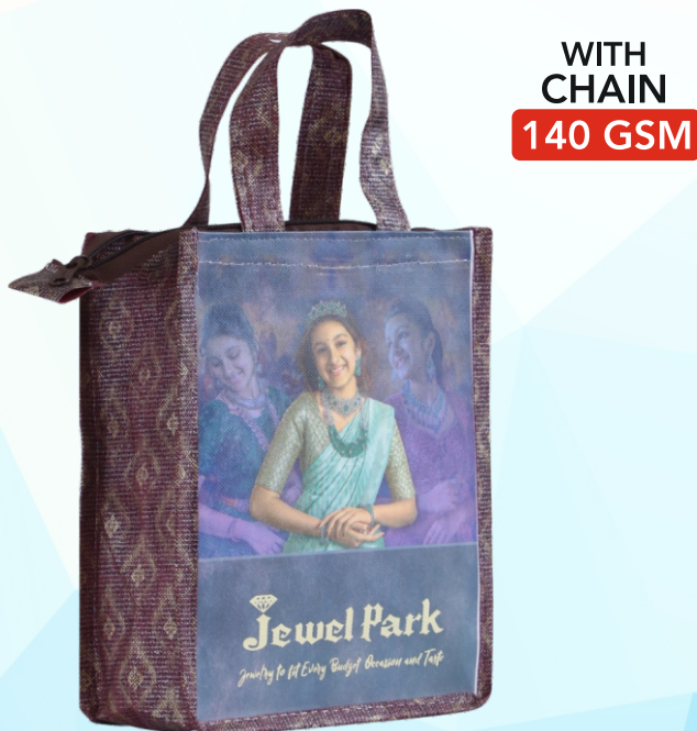
SA-073 | Jewel Park Small Size: 8"x9.75"x3.5"