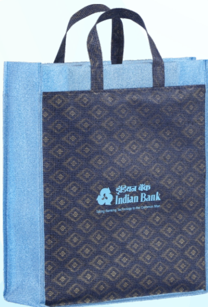
SA-011 | Indian Bank Size: 14"x17"x5"