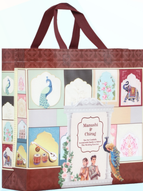
SA-056 | Manushi Wedding