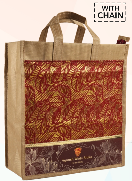
SA-090 | Ayunsh Weds Ritika Size: 12.5"x14"x5"