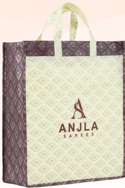
SA-009 | Anjla Sarees Size: 14"x17"x5"