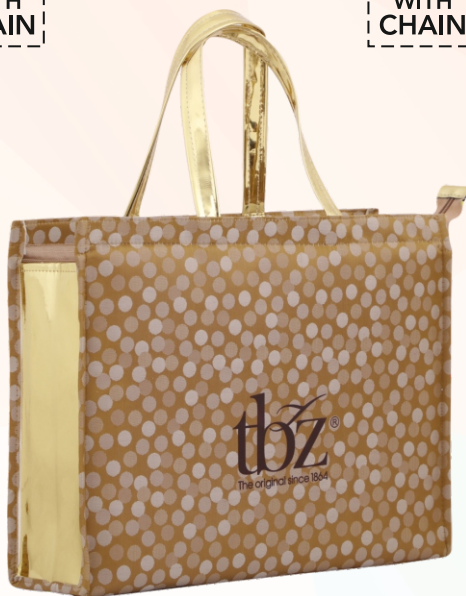
SA-065 | TBZ Size: 13.5"x11"x4"