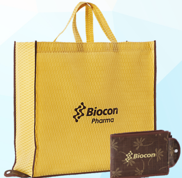
SA-027 | Biocon Pharma Size: 16.5"x15.5"x6"