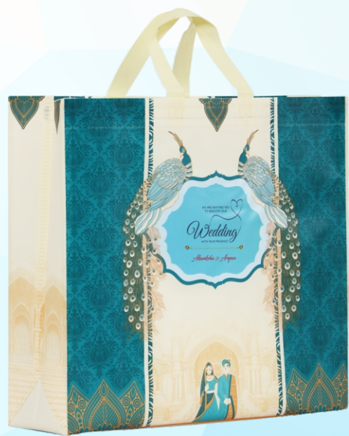
SA-057 | Peacock Wedding