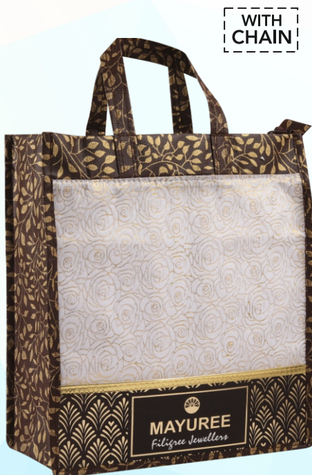
SA-091 | Mayuree Filingree Jewellery Size: 12.5"x14"x5"