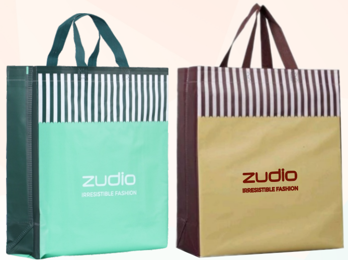
SA-059 | Zudio