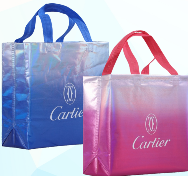
SA-060 | Cartier (Holographic)