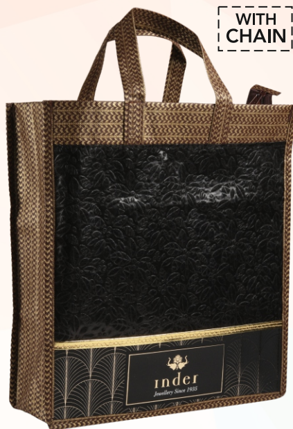
SA-089 | Inder Jewellery Size: 12.5"x14"x4"