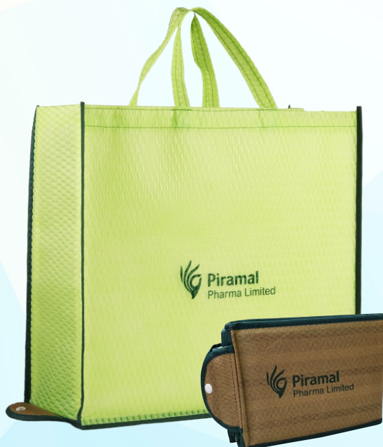
SA-026 | Piramal Pharma Size: 16.5"x15.5"x6"