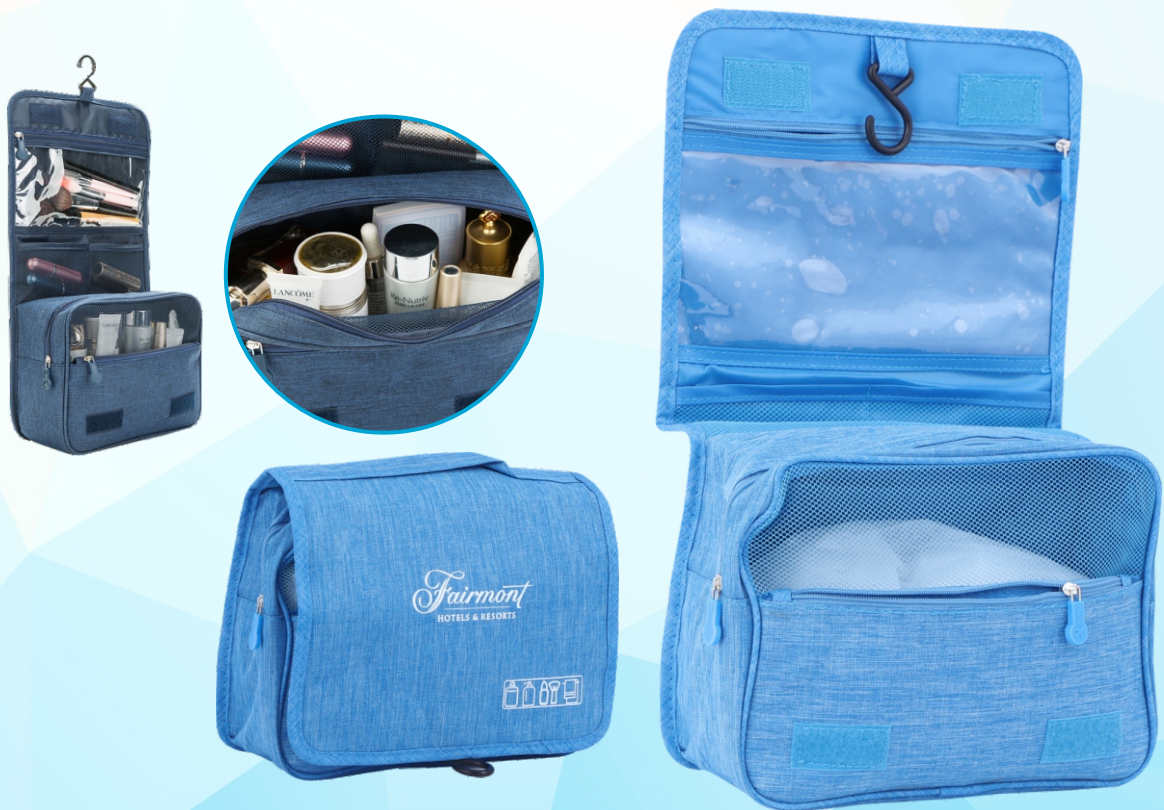
SA-094 | Fairmount Big