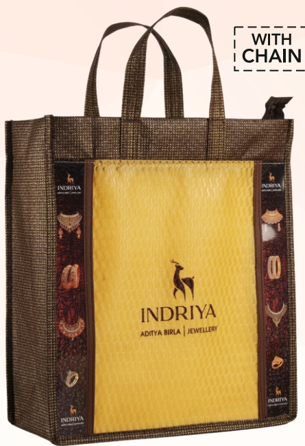
SA-021 | Indriya Jewellery

"A branded bag turns one-time buyers into repeat customers."