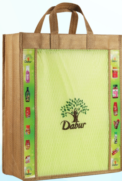
SA-023 | Dabur