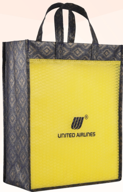
SA-005 | United Airlines

“Customers notice everything — especially your packaging.”