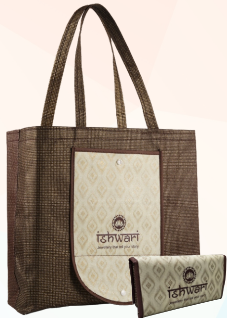
SA-029 | Ishwari Jewellery