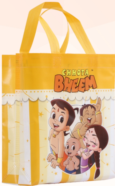
SA-054 | Euro Kids Chota Bheem

"A good bag gets carried. A great one gets noticed."