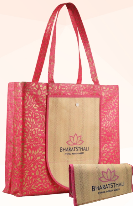
SA-028 | Bharatsthalí

"It's not just a bag. It's your brand's first handshake."