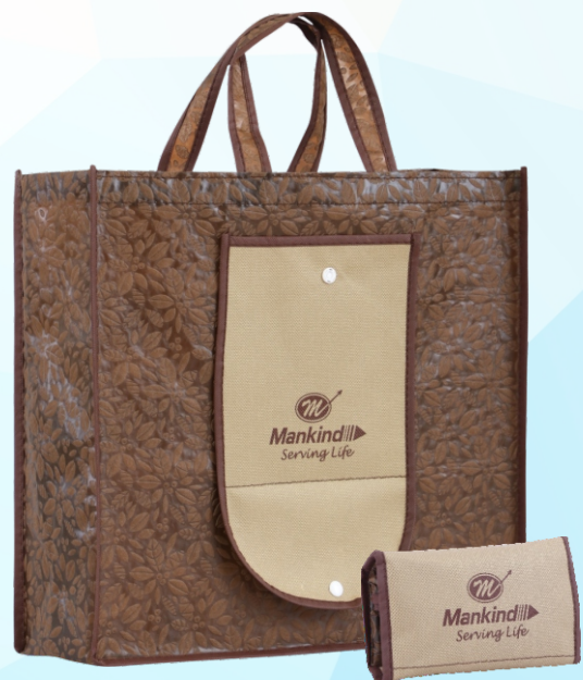
SA-031 | Mankind Pharma