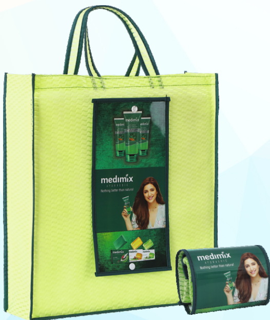
SA-030 | Medimix