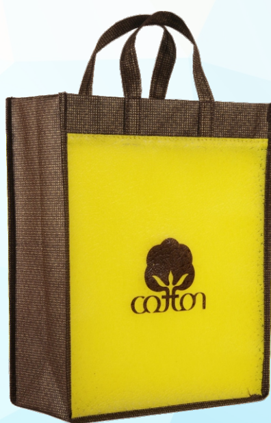
SA-004 | Cotton