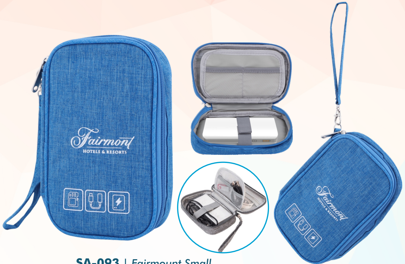
SA-093 | Fairmount Small

"The bag is the message. Make it clear."