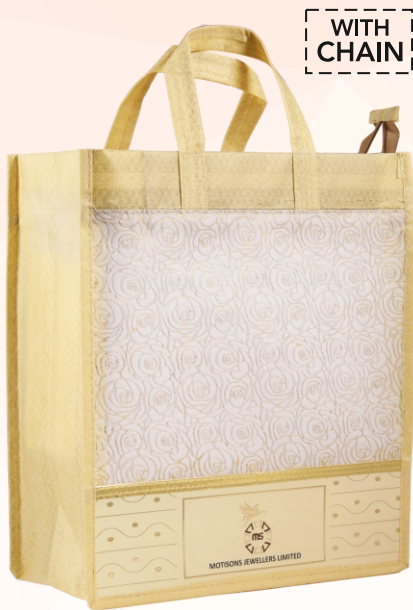
SA-078 | Motisons Jewellers Size: 12.5"x14"x5"

"A thoughtful bag speaks louder than any sales pitch."