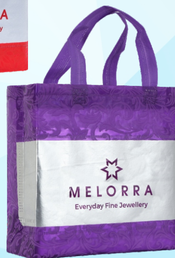
SA-051 | Melorra